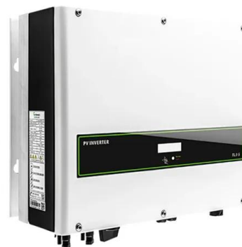
Powin Energy has signed framework agreements with four developers for 5.8GWh of battery storage solutions to be delivered in the 2022-2024 timeframe. The Oregon, US-headquartered energy storage system integrator said yesterday that the systems would be deployed at multiple projects in the US and in Taiwan.