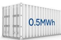
Standard 20ft containers